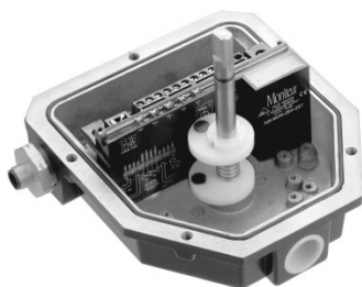
Series A, P and F

Simplified Wiring Advantage from our Networking Systems