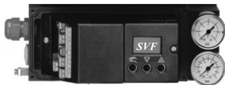
Series SRI990 Positioner

Series A, P and F feature a fully enclosed protocol module/circuit card in an aluminum or non-metallic (Series P) housing. Switch feedback is set using two independently adjustable cams. LED readout for Network Status, Valve Position and Output Transistor (Power to Pilot) status.