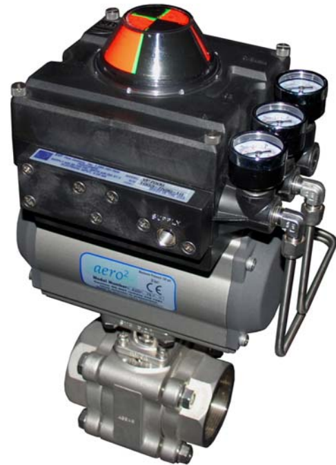
"V" Series Positioner mounted on aero2 actuator and SVF Series V8 V-Ball Valve.